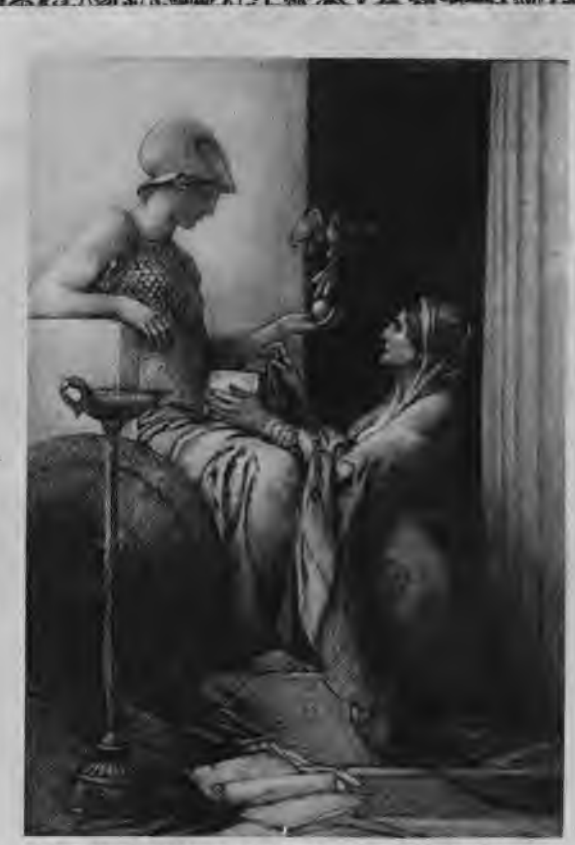
LELAND STANFORD JVNIOR VNIVERSITY